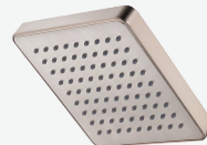
Pfister Square Raincan Showerhead Brushed Nickel Model: 973-228J