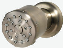
Pfister Shower Body Jet Brushed Nickel Model: 015-BD0K