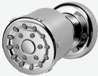
Pfister Shower Body Jet Polished Chrome Model: 015-BD0C