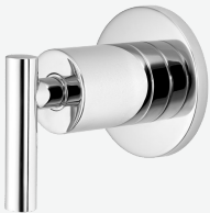
Contempra Diverter Trim Polished Chrome Model: 016-NC1C