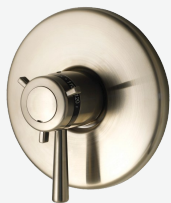
Pfister 1-Handle Tub & Shower Valve Only Trim Brushed Nickel Model: R89-1TUK