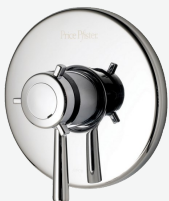
Pfister 1-Handle Tub & Shower Valve Only Trim Polished Chrome Model: R89-1TUC