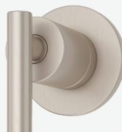
Contempra Diverter Trim Brushed Nickel Model: 016-NC1K