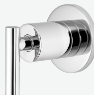
Contempra Diverter Trim