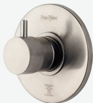
Pfister 3/4" Volume Control Valve Trim Brushed Nickel Model: R78-9VUK