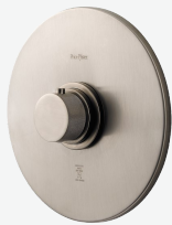
Pfister 3/4" Valve Trim Brushed Nickel Model: R89-9THK