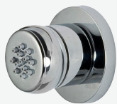
Pfister Shower Body Jet Polished Chrome Model: LG15-HFOC