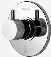
Pfister 3/4" Volume Control Valve Trim Polished Chrome Model: R78-9VUC