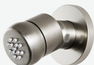
Pfister Shower Body Jet Brushed Nickel Model: LG15-HF0K