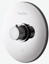
Pfister 3/4" Valve Trim Polished Chrome Model: R89-9THC